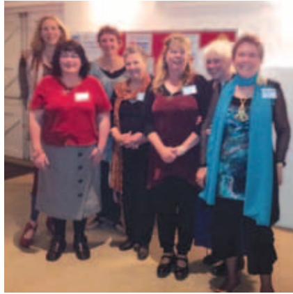
■ THE GALS WITH H'ART TEAM.

Some 23 artists submitted over 90 pieces of art for this year's exhibition. The range of works was extensive comprising of pottery, textiles, painting, sculpture, jewellery, weaving and photography. A percentage of exhibit sales contributed to the funds raised as did a raffle of items generously donated by local businesses. ■