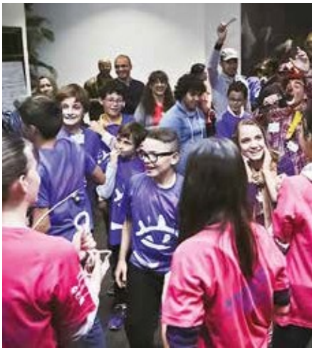
France: An information day for children with MS and their families.

Although MS will sometimes make certain sports or activities more difficult, children with MS should not feel they need to stop being active and rest all the time.